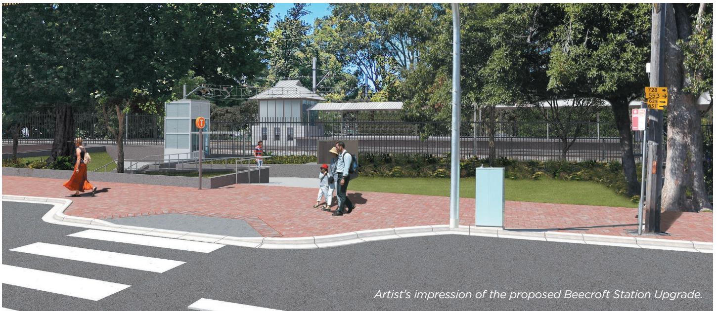
Artist's impression of the proposed Beecroft Station Upgrade.