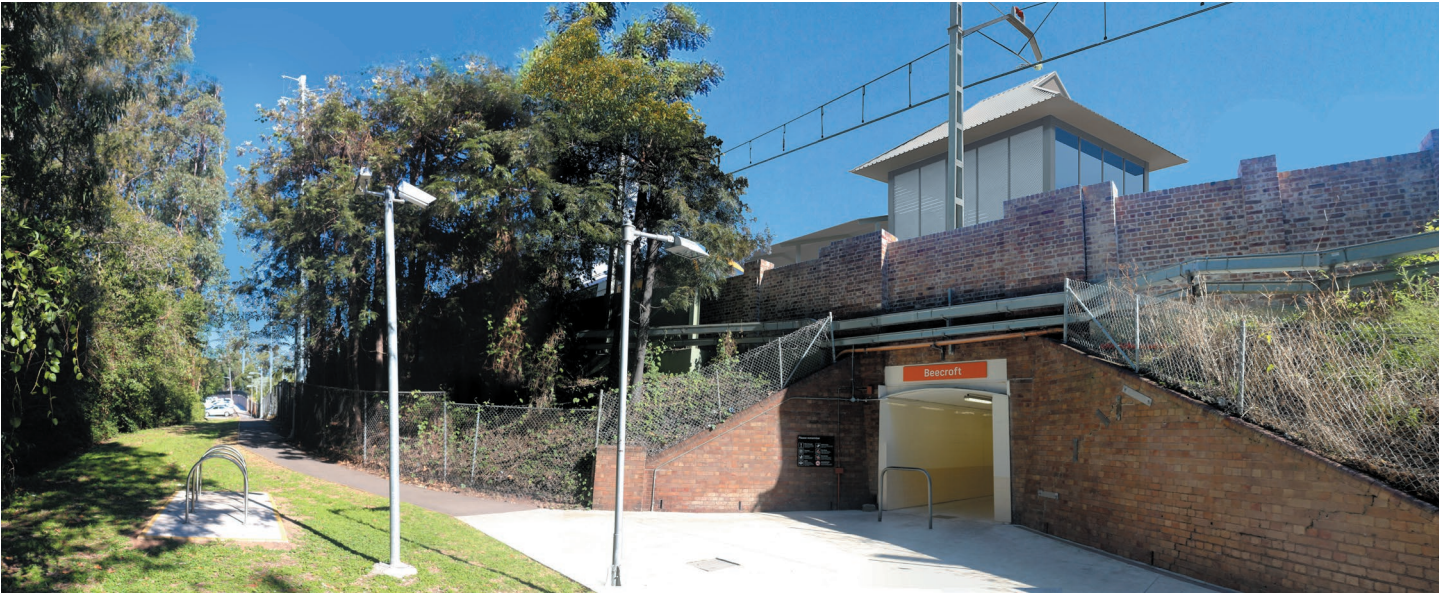
Artist's impression of the proposed Beecroft Station upgrade (subject to change during detailed design).